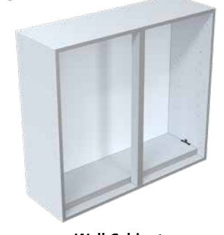
Wall Cabinet, (1000mm wall illustrated, others similar)